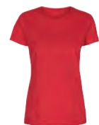
Danish red 17 PMS 200 C