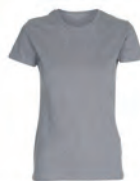
Oxford Grey 34 PMS Cool Grey 7 C