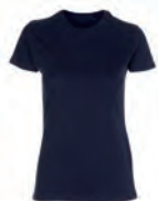
Blue Navy 05 PMS 533 C